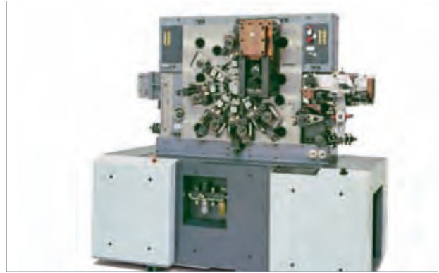
Multicenter MC 42