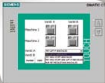
Control unit Visualisation system